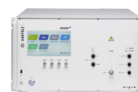
AXOS 8 EFT/Burst Test System

Surge 1.2/50µs...8/20µs IEC/EN 61000-4-5 Telecom Wave 10/700µs (1) IEC/EN 61000-4-5 & ITU Ring Wave IEEE C62.41 IEC EN 61000-4-12 EFT/Burst IEC/EN 61000-4-4 Voltage Dips IEC/EN 61000-4-11 (2) IEC/EN 61000-4-29 (4) Magnetic Field IEC/EN 61000-4-9 (3)