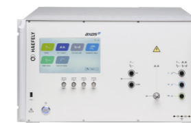
AXOS 8 Surge Test System