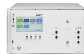
AXOS 8 Compact Test System