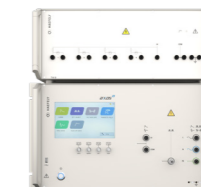
AXOS 8 Telecom Wave System

Surge 1.2/50µs...8/20µs IEC/EN 61000-4-5 Telecom Wave 10/700µs (1) IEC/EN 61000-4-5 & ITU Ring Wave IEEE C62.41 EFT/Burst IEC/EN 61000-4-4 Voltage Dips IEC/EN 61000-4-11 (2) IEC/EN 61000-4-29 (4) Magnetic Field IEC/EN 61000-4-9 (3)