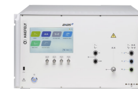
AXOS 8 Ring Wave Test System