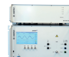
AXOS 8 Dips Test System

Surge 1.2/50µs...8/20µs IEC/EN 61000-4-5 Telecom Wave 10/700µs (1) IEC/EN 61000-4-5 & ITU Ring Wave IEEE C62.41 EFT/Burst IEC/EN 61000-4-4 Voltage Dips IEC/EN 61000-4-11 (2) IEC/EN 61000-4-29 (4) Magnetic Field IEC/EN 61000-4-9 (3)